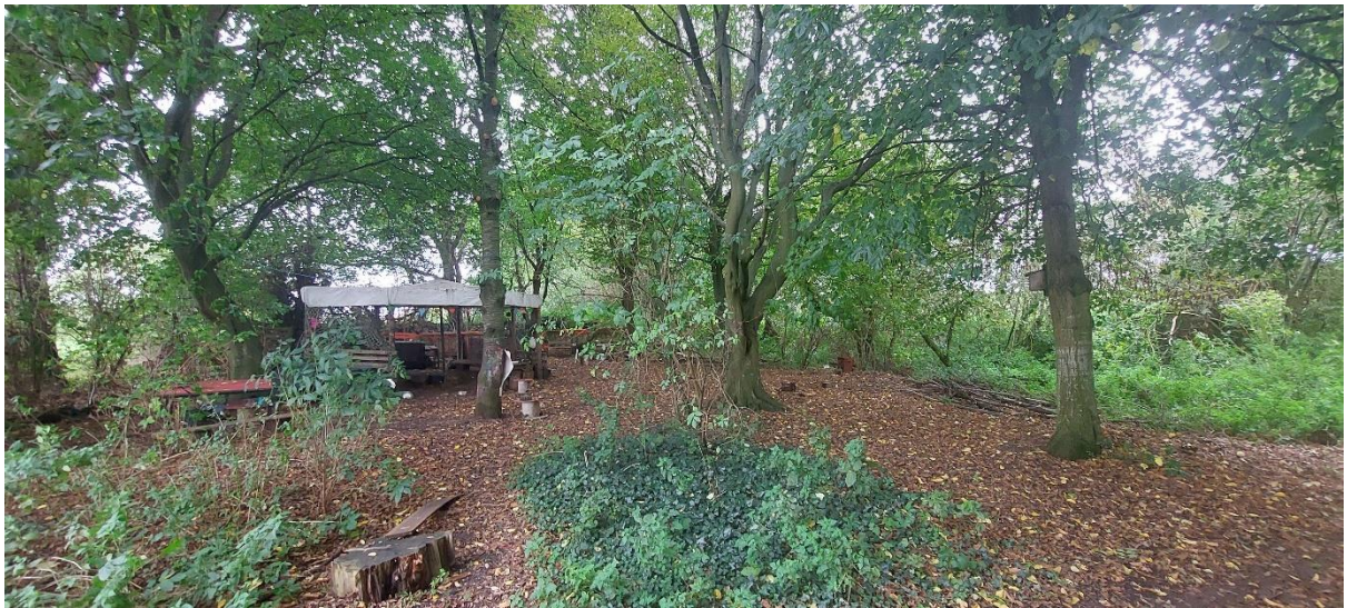
View up the site of the shelter, farm track on the left, stream to the right.