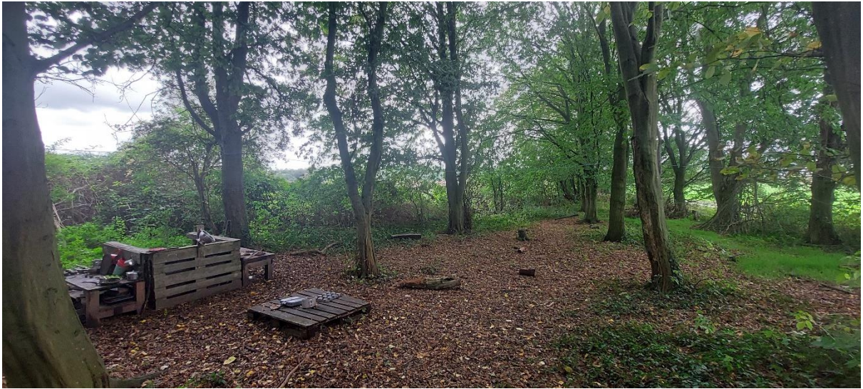
The mud kitchen and swing.