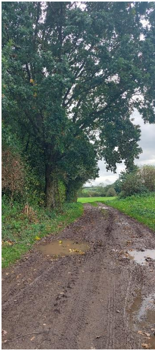
From the car park