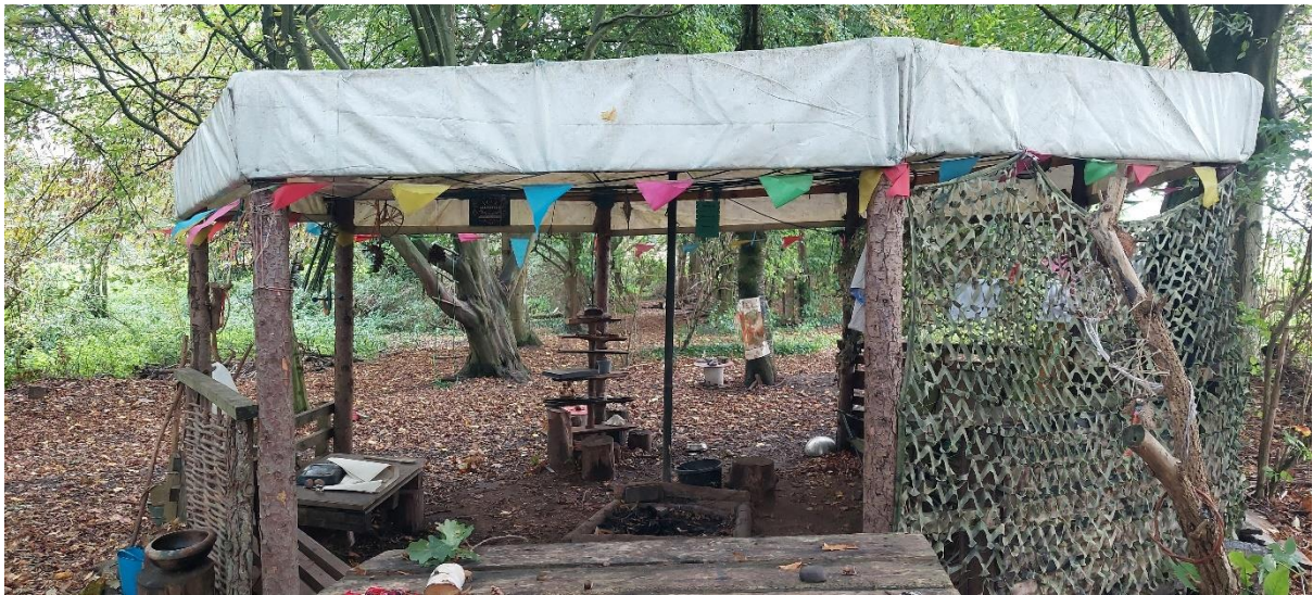
Our shelter and fire pit