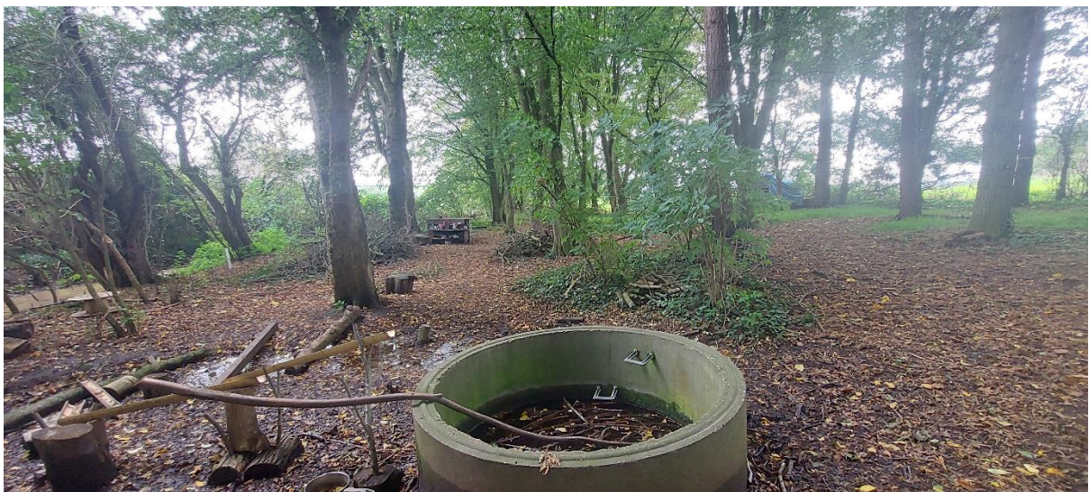
The natural spring, where we collect water for the mud kitchen. This is the area marked by the blue circle on the map.