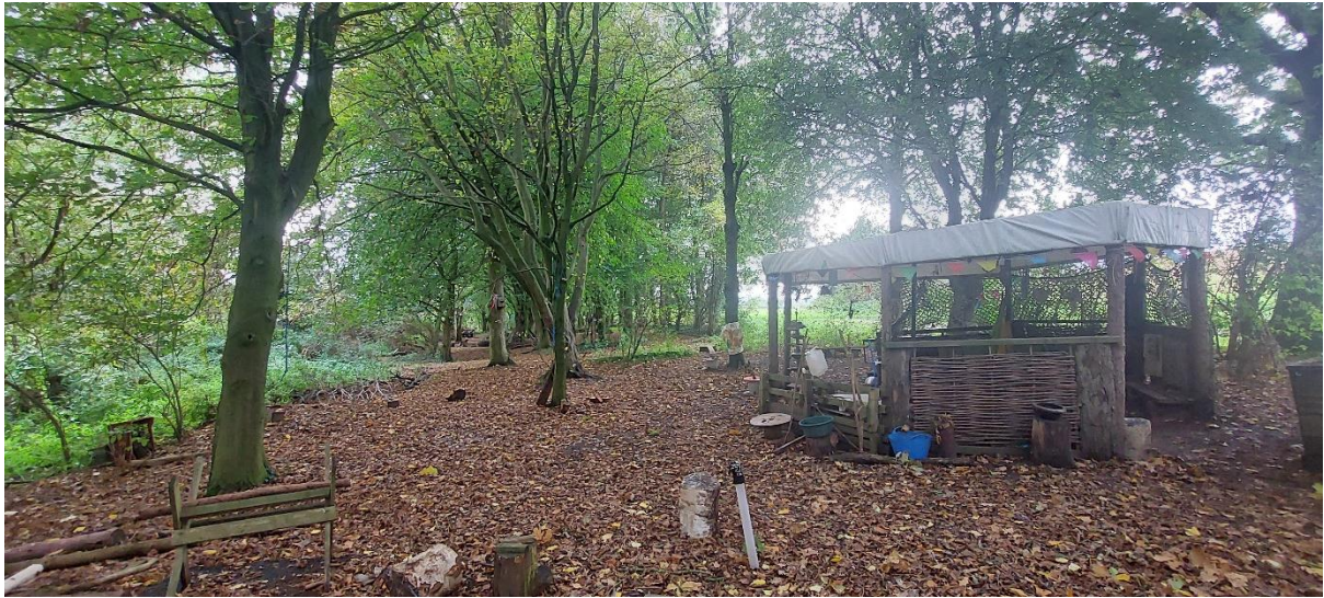
View down the site, stream on the left, farm track.